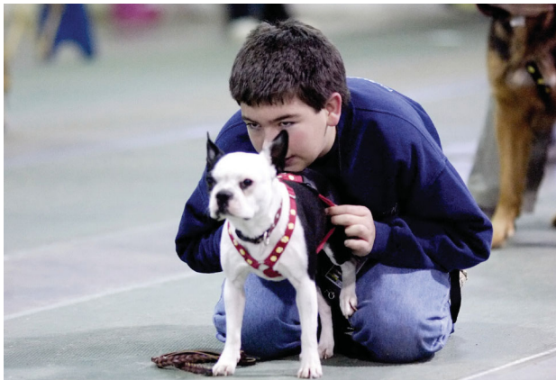
Fun for the whole family