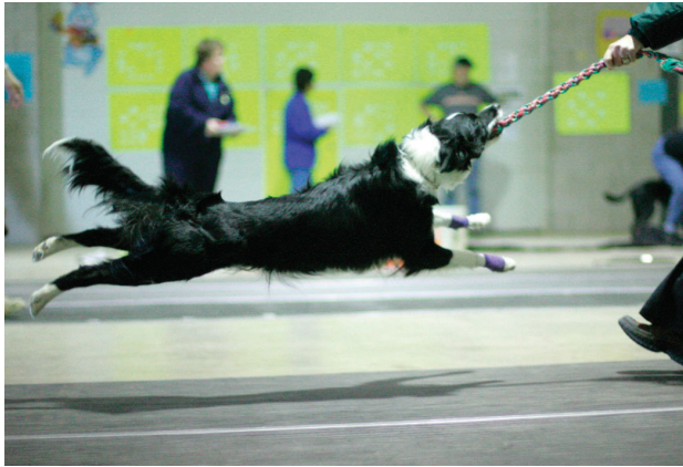
Fast paced competitive action