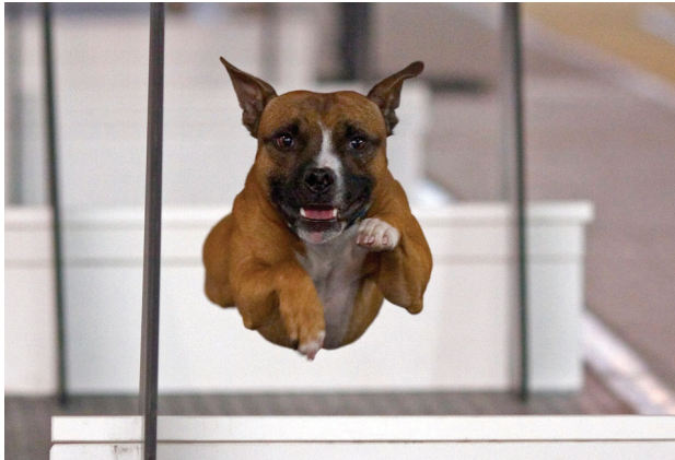
Open to all breeds & sizes