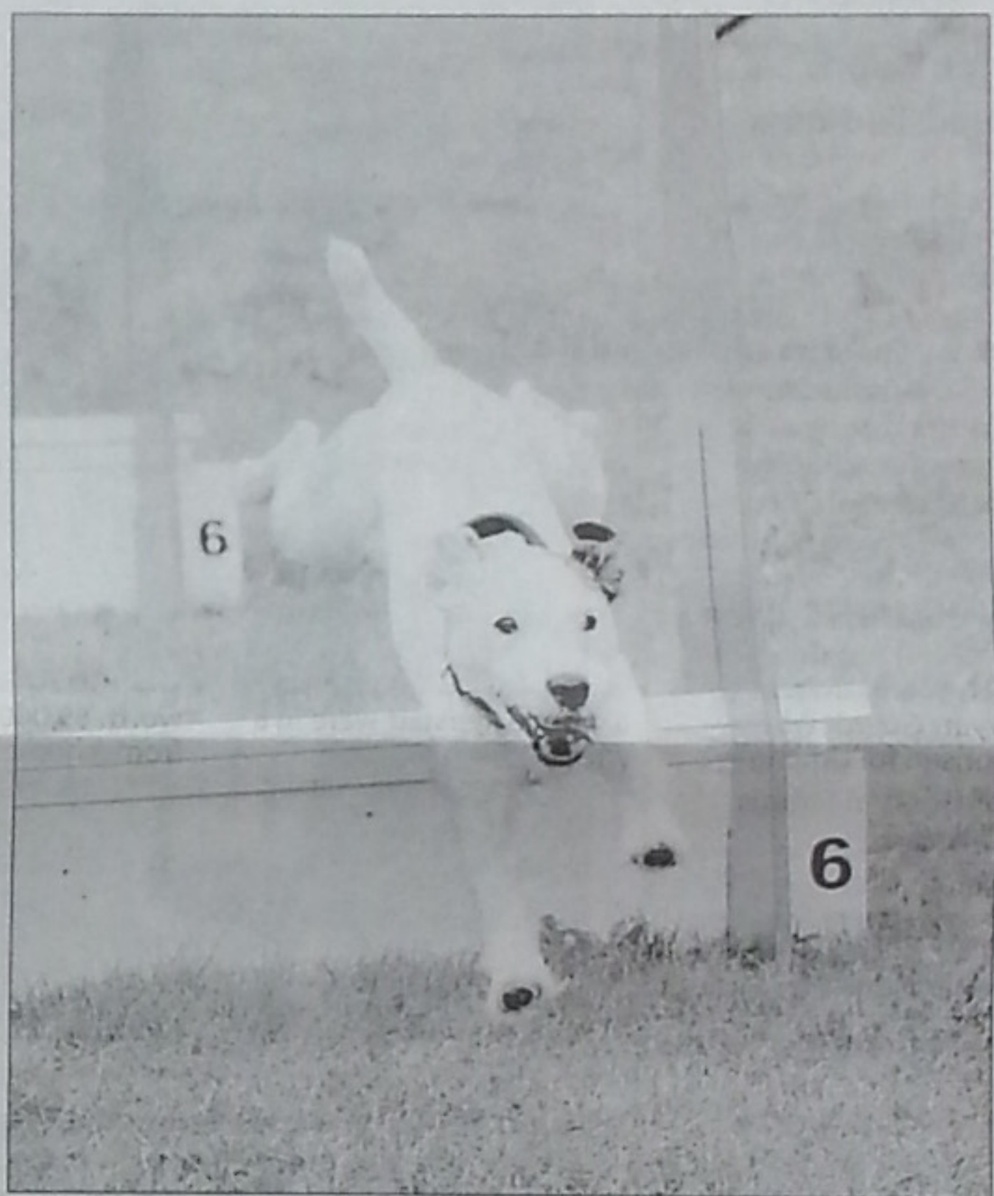
Darby is one of those dogs who was born for flyball, his human says. After the race, Darby left the field carrying a blue flyball.