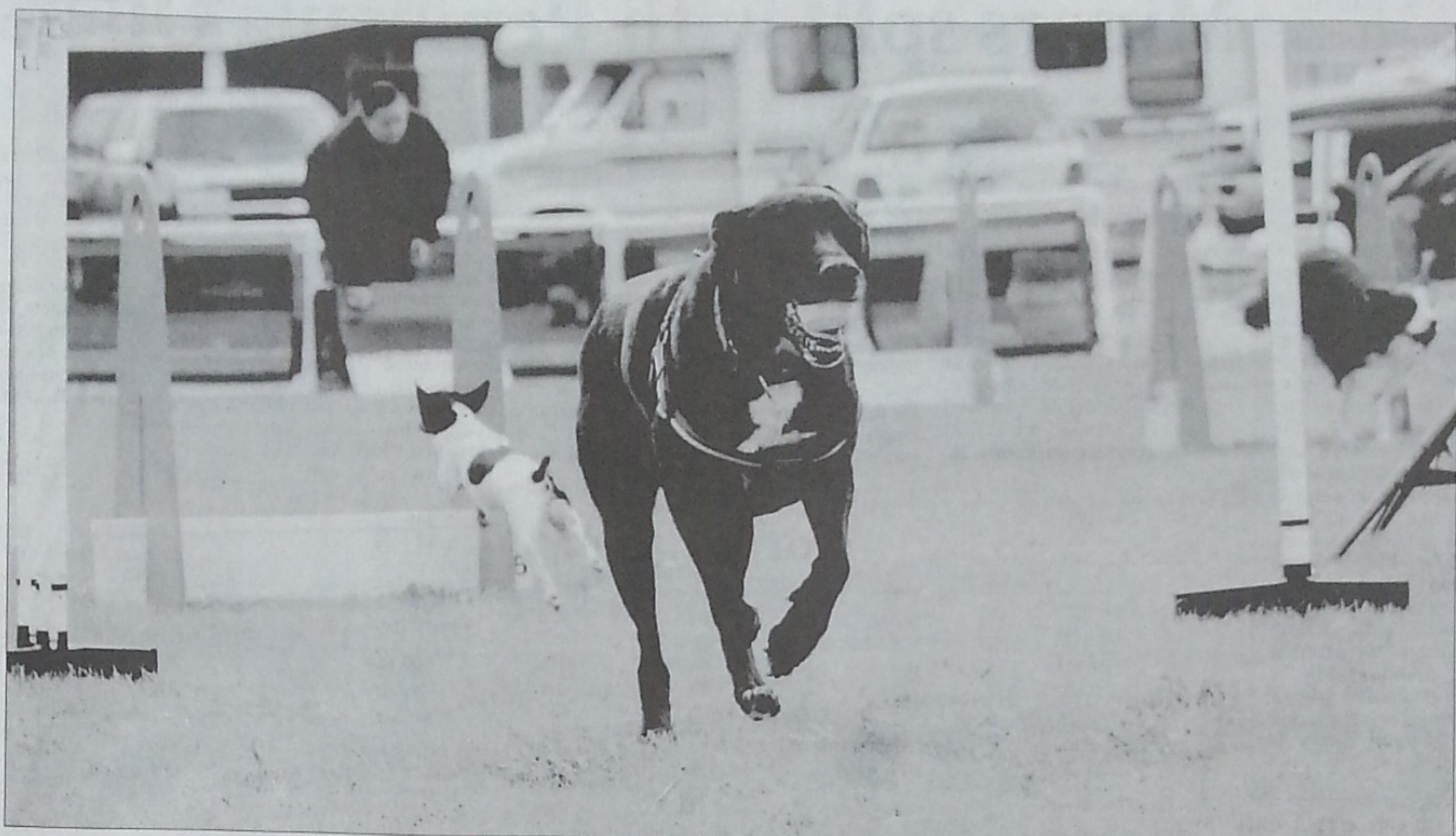
Rocky passes his teammate, 'peanuT' as he heads for the finish line in a flyball race Friday during the 9th annual Alaska Summer Solstice Flyball Tournament at the Alaska State Fairgrounds.