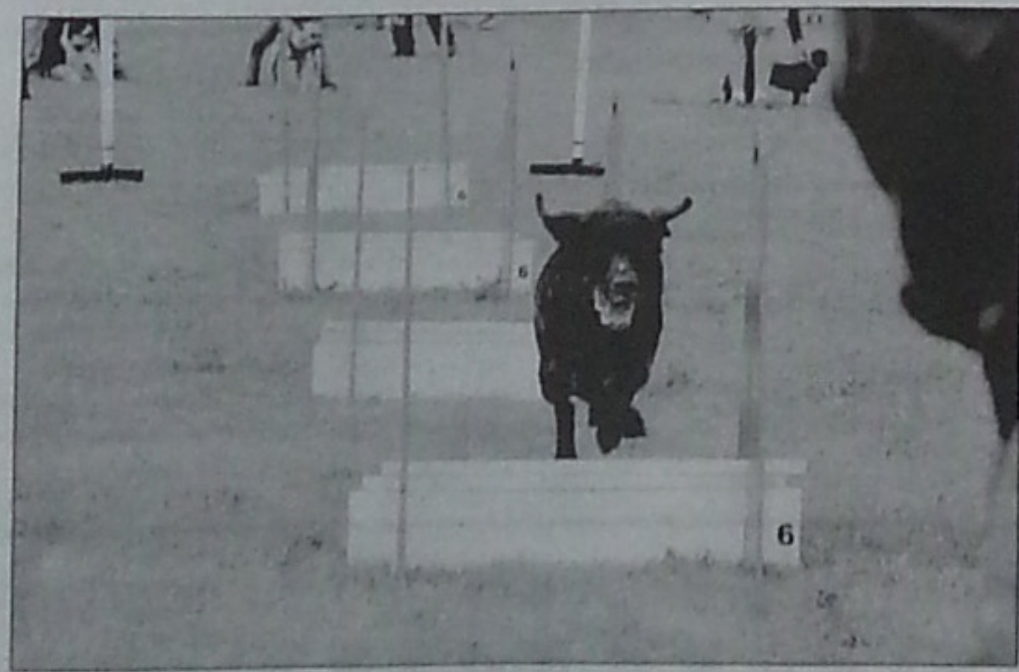
Toby crosses the last hurdle on his way to release the ball from the spring-loaded box.