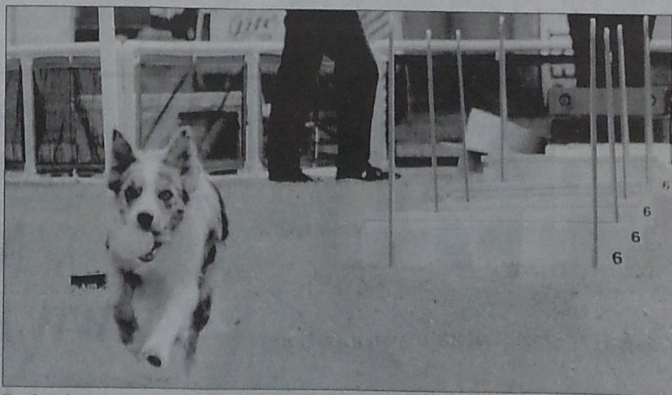
Psych makes his way across the finish line with the tennis ball. Dogs compete in teams of four. Each dog jumps four hurdles, triggers the box, catches the ball and returns through the hurdles to release the next dog.