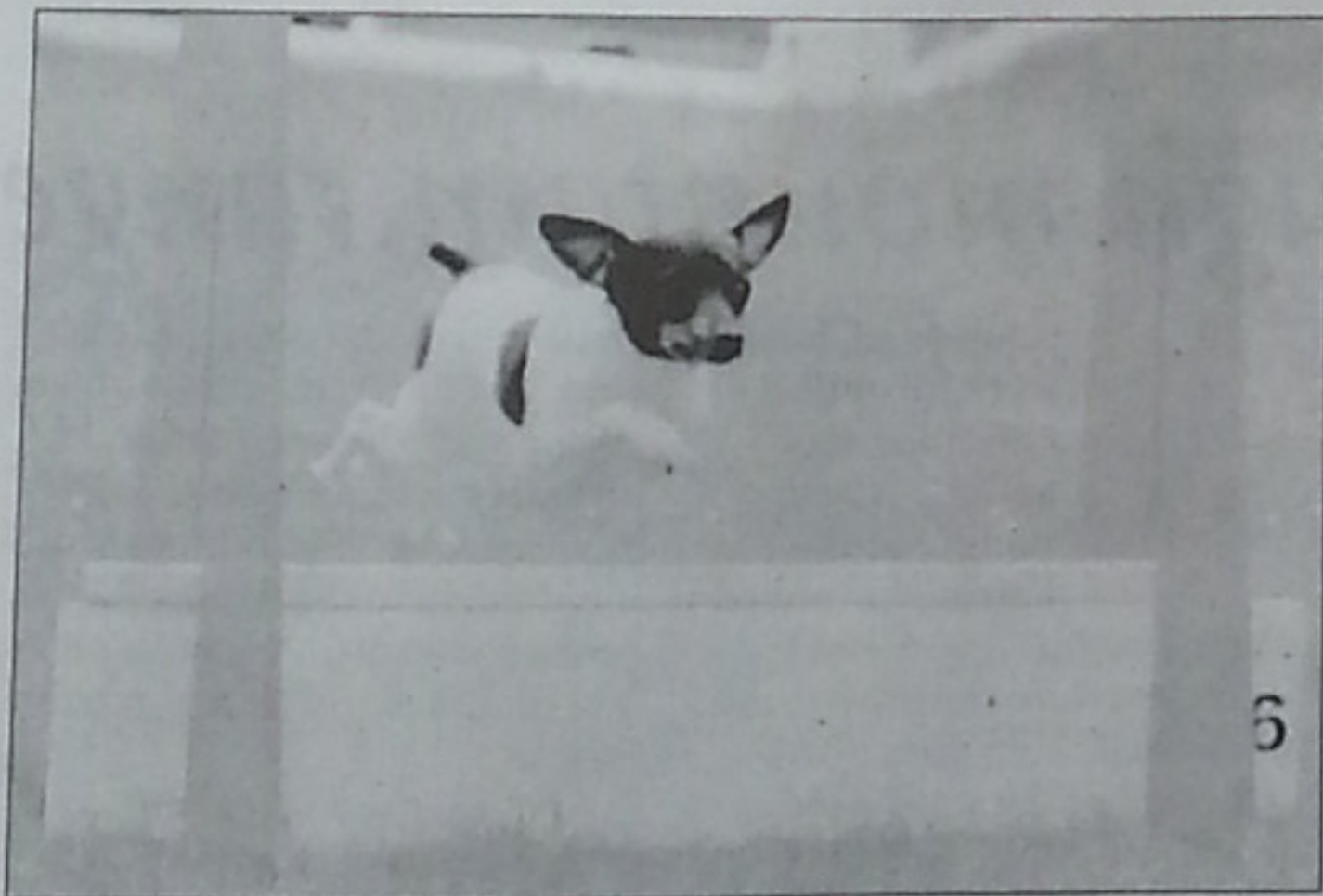
'peanuT' flies over one of four hurdles during a flyball race Friday. The height of the hurdles is set based on the height of the smallest dog on each team, known as 'height dogs.'